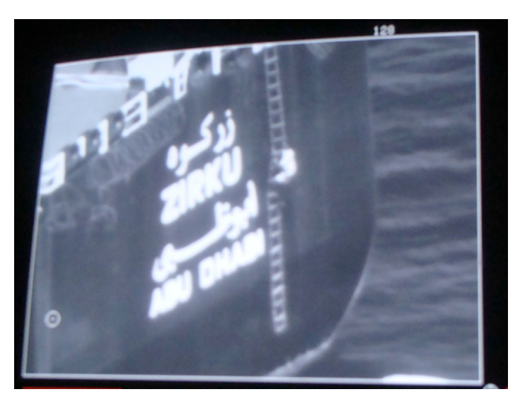
April 2011: Pirates re-supply the tanker Zirku, captured last March with 29 hostages currently imprisoned.

The United States, Britain, South Korea, UAE and France will attack pirates who have control of their flagged ships even after pirates have taken hostages. The United States will attack the skiffs of "motherships" to deny the faster boats needed by a "mothership" to attack a ship. Only the Indian and Russian navies regularly attack and use lethal force in nearly all pirate encounters. There are reports that every Somali who has boarded a Russian ship has not survived the encounter.