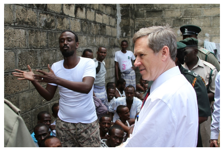
Senator Kirk at the Shimo la Tewa Prison in Mombasa, Kenya where five dozen Somali pirates are held, including Ahmed Abdulkadir Hersi.

The Pirates (est. 2,000): Somalibased pirates are organized based on clan structure, with no single strategy or chain of command. This independent and decentralized structure makes pirate organizations extremely difficult to dismantle. Reports suggest that there are approximately 10 of these organizations with complex financing and operational frameworks. Pirate stock markets are functioning where pirate groups seek investors to