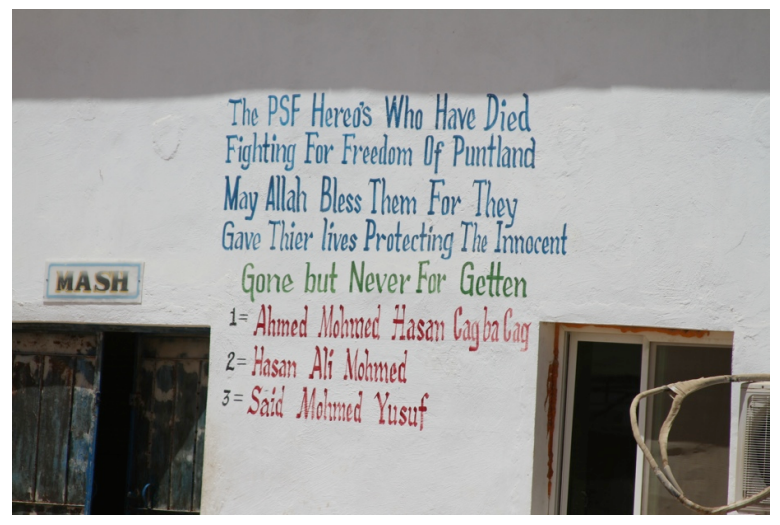
Bosasso, Puntland: Three members of the Puntland Security Force died in recent fighting to repel an attack by Al Shabaab terrorists.

Somaliland (16,000): Somaliland, the northwestern portion of Somalia, is a functioning, semi-autonomous region that has held several democratic elections since 1991. This stability has allowed Somaliland to become relatively prosperous, and this prosperity has led to a powerful secessionist movement. Although the region declared its independence in 1991, it is not recognized by any nations in the international community.