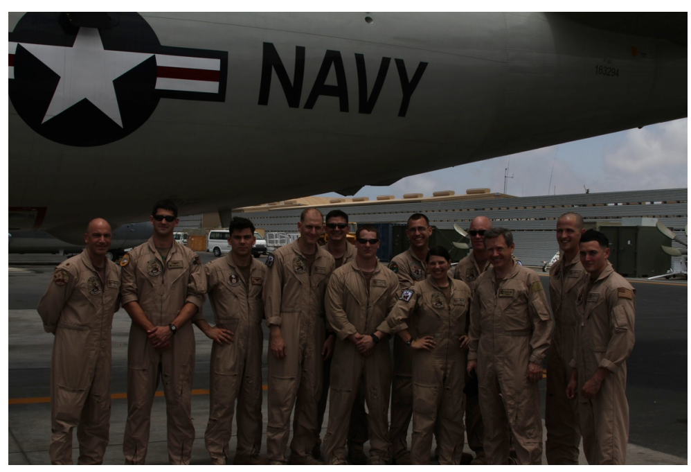
Senator Kirk wishes to thank VP-5, CJTF-HOA and the State Department / USAID for their efforts against the growing threat of piracy.

On September 28, 2010, pirates attacked M/V Asphalt Venture just southeast of the Tanzania coast. The ship was ultimately released after a $3.5-million ransom was paid, and eight of its crew returned home to India. The twist in the story is that the M/V Asphalt Venture had a crew of 15, and the remaining seven are still held hostage by the pirates, who are now demanding the release of 100 pirates captured by Indian naval forces.