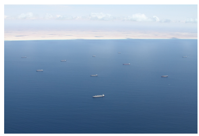
April 2011, 11 of 13 Western and Allied ships captured by pirates lie at anchor off El Danaan, Somalia. Over 280 hostages are currently held on the pirated ships.

grew from less than 100 in 2005 to more than 2,000 in 2011.