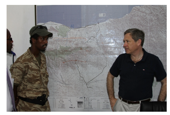
Bosasso, Puntland: The commander of the Elite Puntland Security Force detailing a failed attack by Al Shabaab terrorists.

ASWJ (6,000): The ASWJ is a political, social, and militant group aligned with TFG and Ethiopian forces. They support Ethiopian operations against al-Shabaab, and find their support in Somalia's Sufi population. The ASWJ has approximately 4,500 fighters.