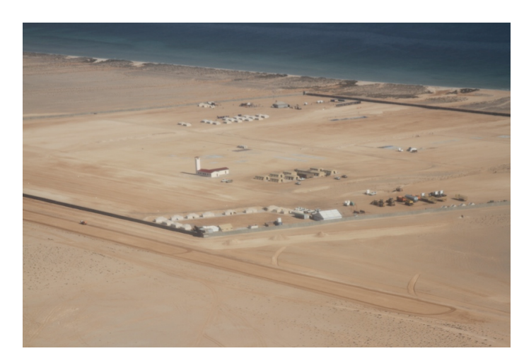
International donors initially funded a Puntland Maritime Security Force to confront pirates. After the press wrote about this effort, it was largely suspended.

Puntland : In late 2010, unidentified foreign donors financed a program to recruit and train a counter-piracy force for Puntland. After allegations that this force violated the UN arms embargo, it was put on hold indefinitely. If the UN decides to support the formation of this force, it could be reconstituted and running by the end of 2011.