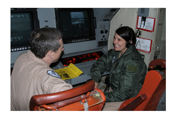
Overflying hostages at anchor: Senator Kirk with LTJG Alyssa Wilson (Plainfield, IL) of VP-5 (U.S. Navy monitoring in background)

Mohamed Hassan Abdi "Afweyne" (Hawiye Clan) --